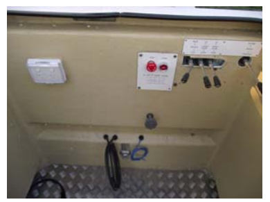
Inside the upgraded basket.