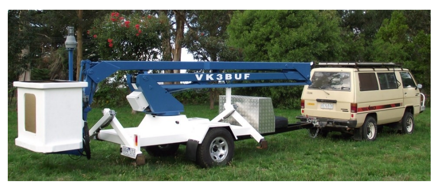
The completed unit, shown with antenna rotator column

from the local chain saw & mower store, the engine governor was recalibrated, now the engine runs very smoothly, even under full load. The tool box was mounted and contains all relevant safety harnesses, tools, a