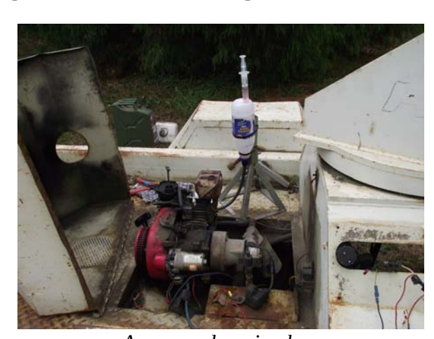
A very sad engine bay

The first order of business was to get the motor going. I mounted an inverted milk carton on a wheel stand as a temporary fuel tank and tried to get it going with the pull-start. It was difficult to start, but I did get it going long enough to show that the hydraulic pump and lines were all still intact. I certainly was not game to ride it more than 2 metres off the ground at that stage.