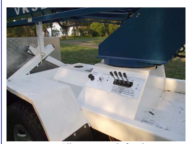
All new controls fitted

While this was going on, other important work was taking place. The original wheels and tyres were scrapped. Some chunky off-road wheels and tyres were provided by a friend. The rims were also re-sprayed in