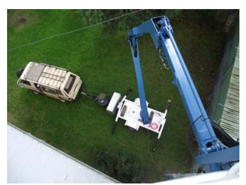
View from the GGREC tower

The machine was now ready for testing on the road. It is a heavy lump, and the poor Mitsubishi van certainly notices it on hills, but the inertia brakes work a treat. Moving it around with the 4WD van has proven to be essential, as in low range it can creep around in tight places without cooking the clutch and spinning on wet grass.