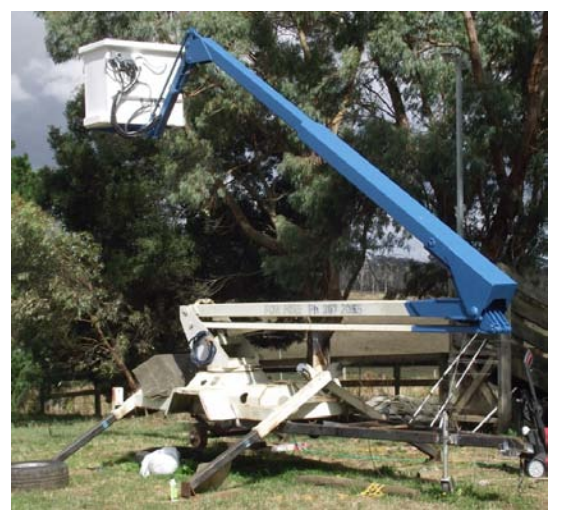
The restored basket & half-painted boom

The operator console inside the basket was replaced with a new engraved plate, then fitted with illuminated motor stop/start controls. An old 240V power outlet was replaced with a new double outlet and waterproof protective cover. This allows an extension cord to be plugged into the bottom and power tools can then be used in the basket. As the original edging was missing, some replacement edging rubber was sourced from Queensland via Ebay to soften the hard edges around the inside lip of the basket. .