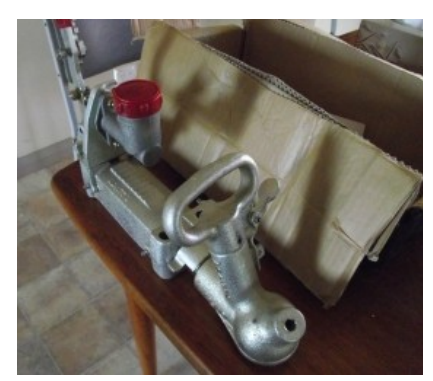
An $80 tow hitch replacement

it was washed with petrol-soaked rags and primed with more zinc paint. For this sort of work a fine 75mm paint roller and long-handle brush is much better to use than spray painting. There are no over-spray issues, the paint can be put on with its native thickness and is less-likely to run on vertical surfaces. Also, between sessions a little cling-wrap on the roller can keep the brush and roller moist, allowing a lot of small