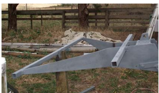
Before and after the repair of the basket support structure

protective floor was added to the basket, giving it a tough, work surface. The stainless steel anchor point for the safety harness looked a bit weak, so it was reinforced through the wall of the basket with a larger backing plate. All prepared metal surfaces, particularly on hydraulic fittings, were primed with a heavy cold-gal zinc based paint.