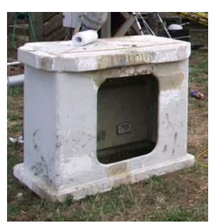
A basket case...

Little by little the engine was put back together. It would now start and run ok, but the mechanical governor for tracking engine revs was not yet working. This meant that I had to set the revs quite high to stop it from stalling when the hydraulics were activated.