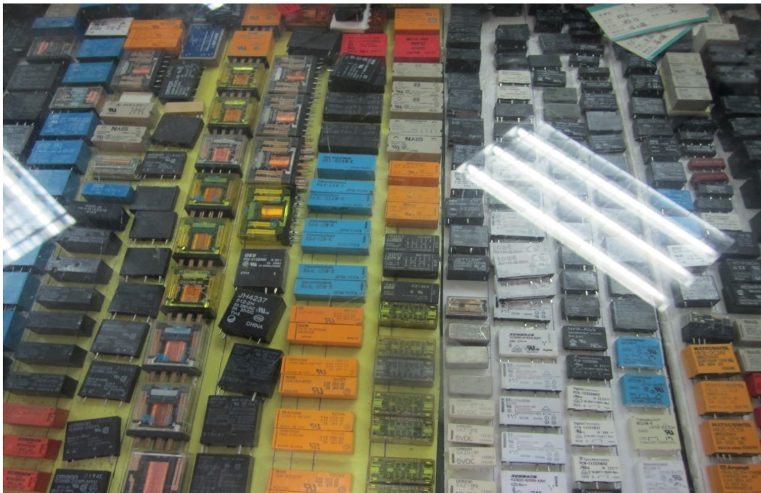
Relays...um have you got these in blue?

My agent earns their commission, haggling prices, talking down minimum-order-quantities and making sure that parts are genuine. It is very much a grey market and is not always right for the parts we need. One must still do their sums, as the cost of freight still affects the great prices that are being quoted, but it remains an amazing resource to tap into.