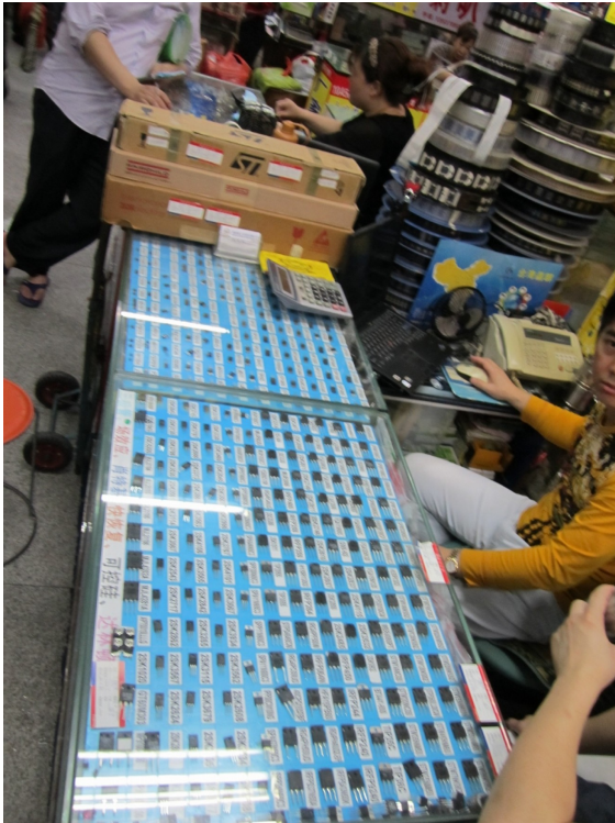
Semiconductors by the bag or reel

There are many specialist stalls, that trade in connectors, small screws, LCD displays and hand tools for manufacturers. It was very loud and the only words of English heard were our own.