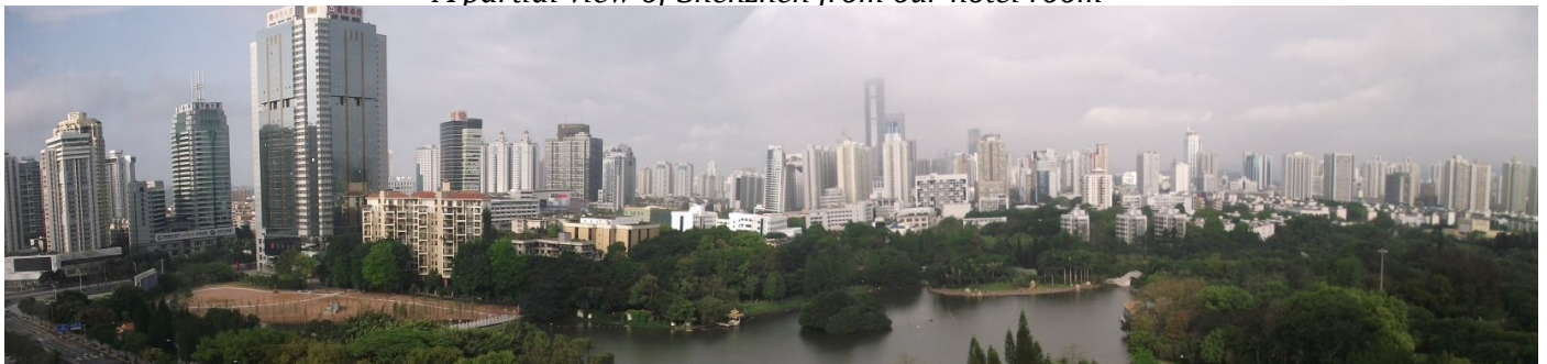
A partial view of Shenzhen from our hotel room