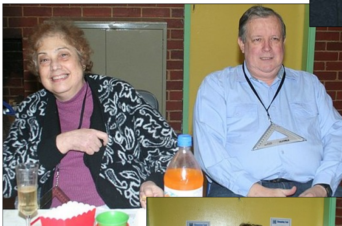
THE MIDYEAR DINNER CELE- BRATED 'BE THERE AND BE SQUARE'