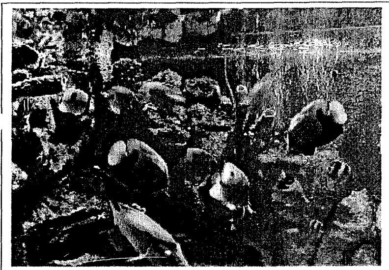
This is some fish at the aquarium....

Please let us know if you are interested in coming, as soon as possible so that bookings can be made for the meal at the Golf Club and the Caravan Park.