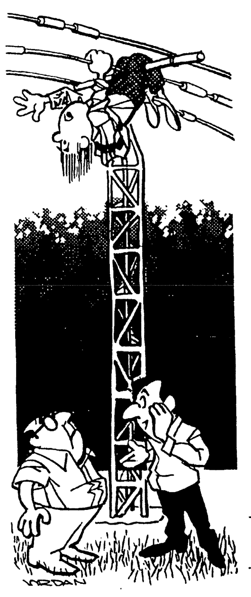
I'd help Ralph get down but he's giving me a 1:1 SWR!